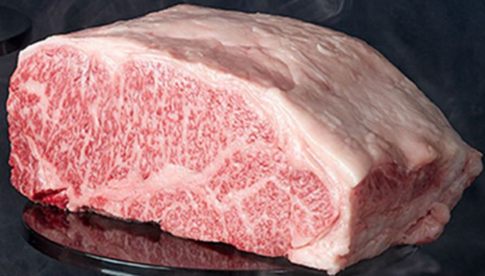
A5 WAGYU STRIPLOIN