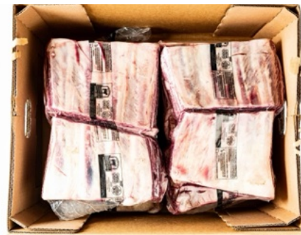
US BEEF BONE-IN CHUCK SHORT RIB

Code : 40046PR Whole 1/3 inch cut Grade : Prime Piece : 12 lbs Piece : 12 lbs Code : 40046 Case : 60 lbs Case : 60 lbs Grade : Choice