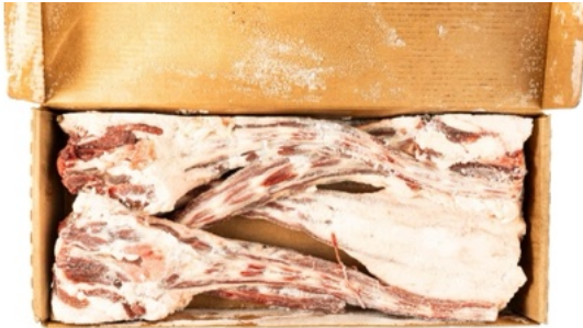
US BEEF OXTAIL