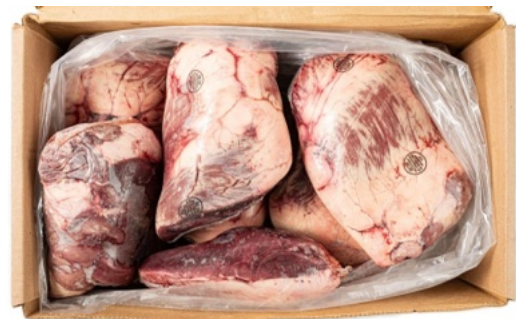
US BEEF HEART