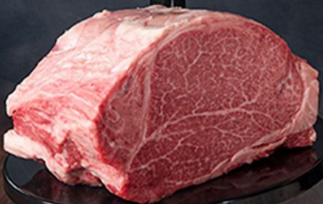
A5 WAGYU TENDERLOIN