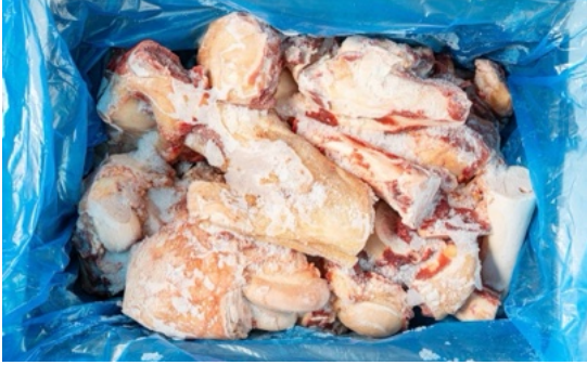
US BEEF 3PC MIXED BONES