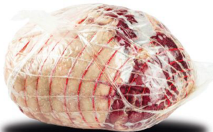
OTHER PREMIUM MEATS