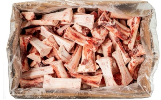
US BEEF C/C FEMUR BONES 60#