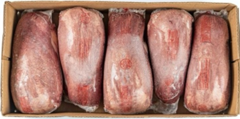
BEEF TONGUE CROWN CUT