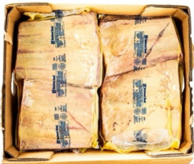
US BEEF BONE-IN SHORT RIB

Code : 40046PR Whole 1/3 inch cut Grade : Prime Piece : 12 lbs Piece : 12 lbs Code : 40046 Case : 60 lbs Case : 60 lbs Grade : Choice