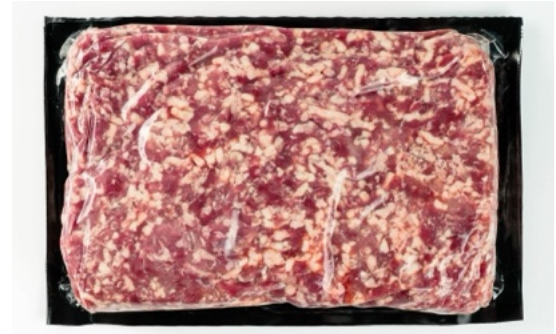
US GROUND BEEF