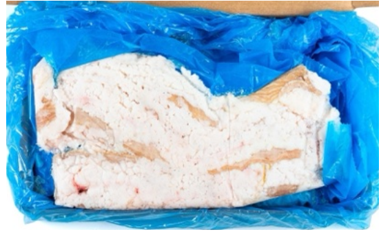
US BEEF LARGE INTESTINE SPLIT