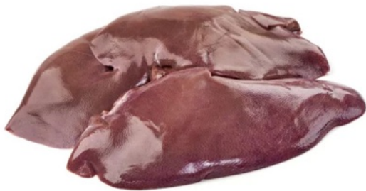
US BEEF LIVER