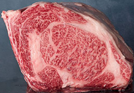
A5 WAGYU RIBEYE