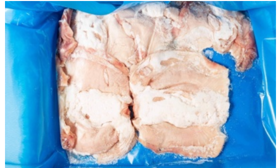
US BEEF ABOMASUM