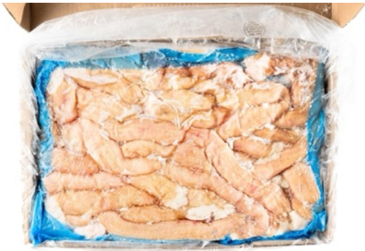
US BEEF LARGE INTESTINE TUBE